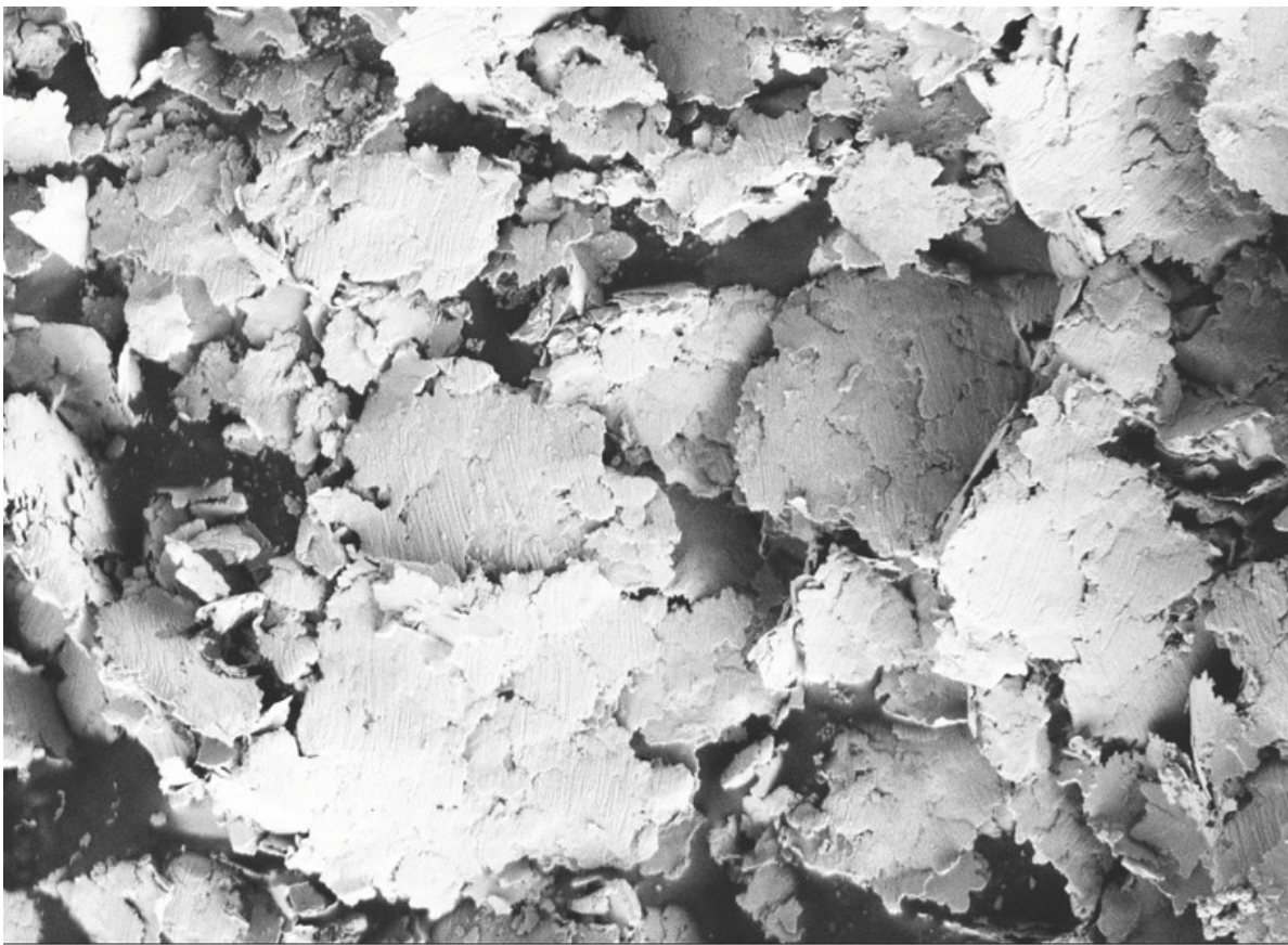
1 µm EHT = 2.00 kV Signal A = SE2 WD = 3.3 mm Mag = 4.00 K X